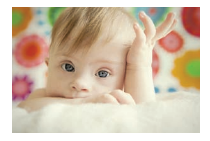
People with Down's syndrome have more in common with their families than with each other. Just like the rest of the population, they will inherit family characteristics.

The quality of life, life expectancy and role in the community for people with Down's syndrome have gradually been transformed as education and support have improved. In fact the opportunities for people with Down's syndrome to lead the lives that they want have never been greater. However, we know that we still have work to do to ensure that people