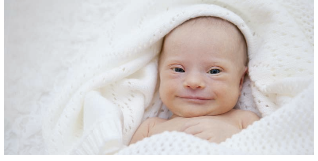
This leaflet has been written to give you basic information about Downs's syndrome, to provide some tips about supporting the new parents and to highlight further sources of information.