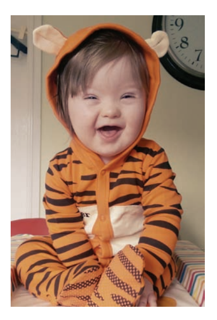
It's OK to be sad and cry. It's OK to be angry or worried. It's OK to be happy too!