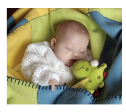
Every day in the UK, between one and two babies are born with Down's syndrome, which means that one baby in 1000 has the condition.

Down's syndrome is a genetic condition caused by the presence of an extra chromosome in the baby's cells.